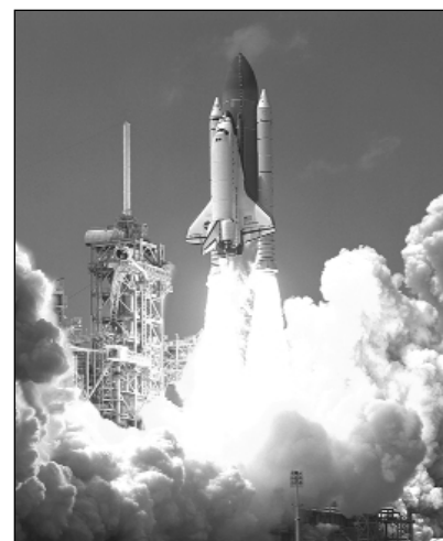
One aspect of the researchers' work will be to improve fuel consumption, now at 500,000 gallons per shuttle launch.