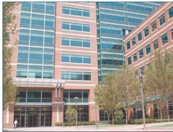
The Centergy Building in Technology Square is home to the Advanced Technology Development Center and other service programs for startup companies.

ATDC will continue to offer traditional "bricks-and-mortar" incubation space on entrepreneur-friendly terms, both in midtown Atlanta and Savannah. Recognizing the sprawl of the Atlanta metro area, ATDC will offer programs outside the Perimeter where dense clusters of entrepreneurs can benefit from its services. Since 1999, the state-funded ATDC Seed Capital Fund has made equity investments in Georgia startup companies alongside angel investors and